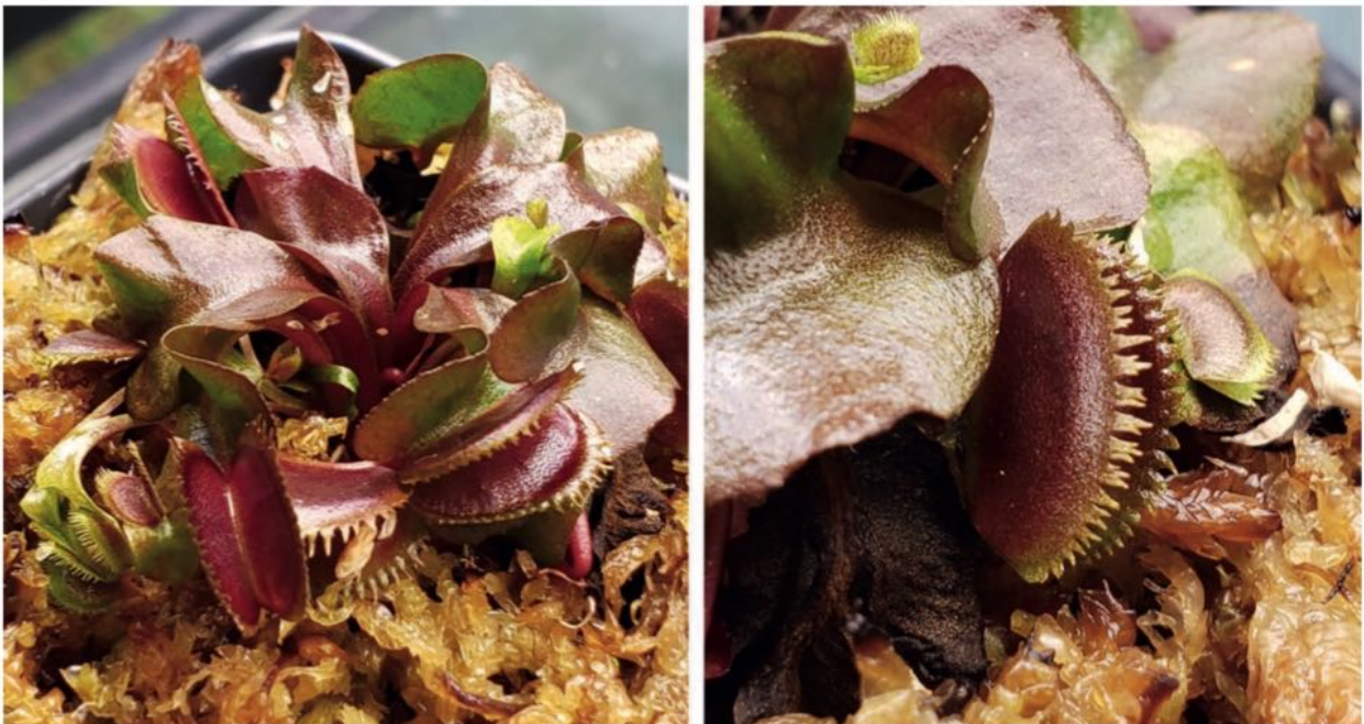
Figure 2: Dionaea 'EEC Purple People Eater'.

—EVAN WANG • Ev & Em Carnivorium • Palo Alto • California • USA • and • CRAIG HEATH • Crazy Craig's Carnivorous Plants • Lorton • Virginia • USA • stephen_wang2000@yahoo.com